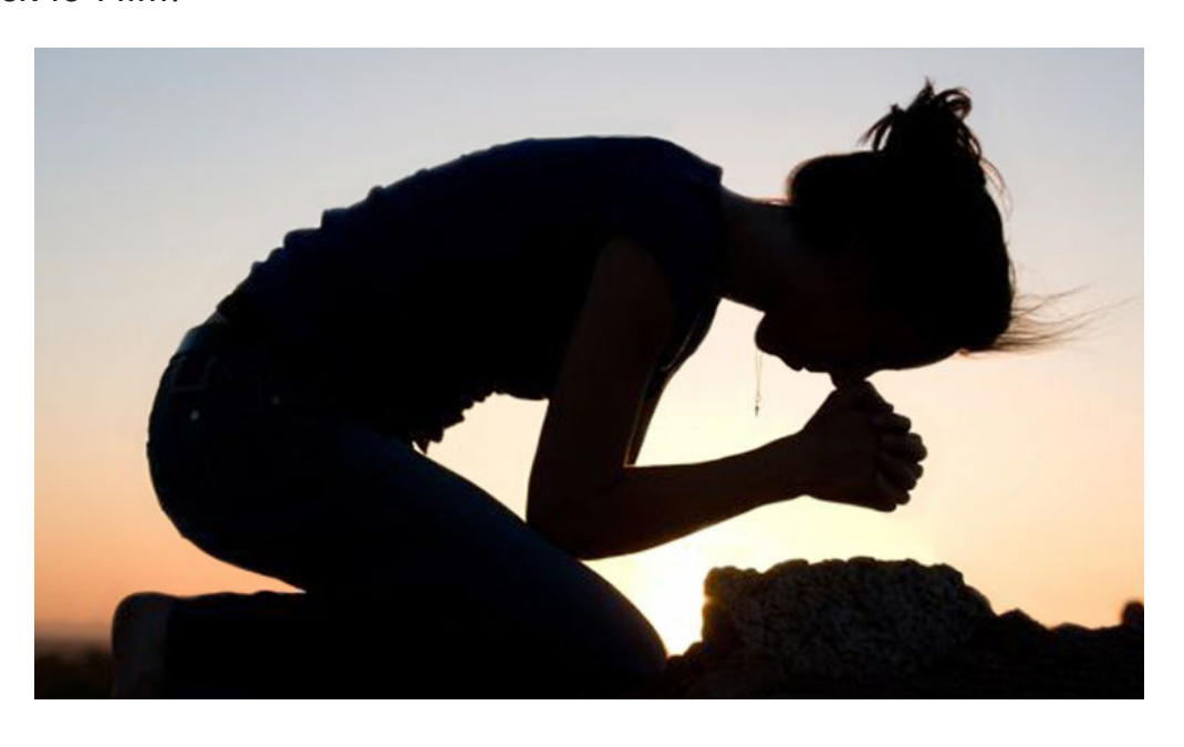
All Scripture references are taken from the New International Version.

These are written prayers that cover a large spectrum of need not only for the unreached but also for global workers, the persecuted, barriers and strongholds of the enemy, and even prayers written for you as the one who prays. They can also serve as a catalyst for further personal or group intercession and Bible study. This guide is full of God's Word. Jesus loves it when His people pray His Word back to Him.