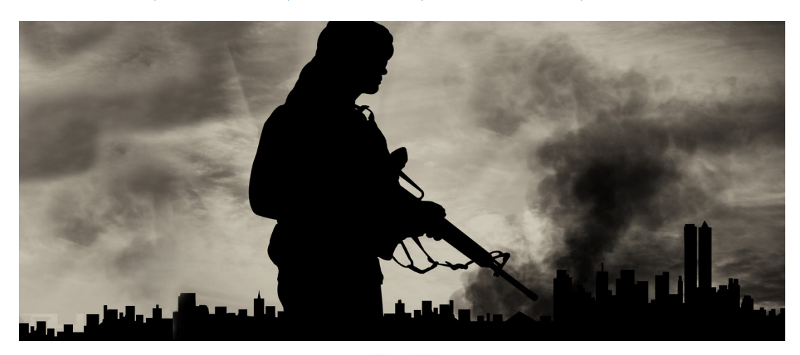
Psalm 36:1-2, Psalm 51:1, Luke 19:10, Ezekiel 18:21,23