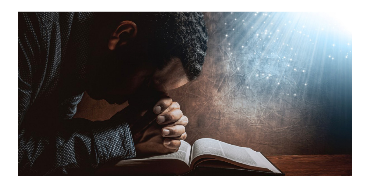
Haggai 2:7, Romans 4:17, Psalm 126:5,6